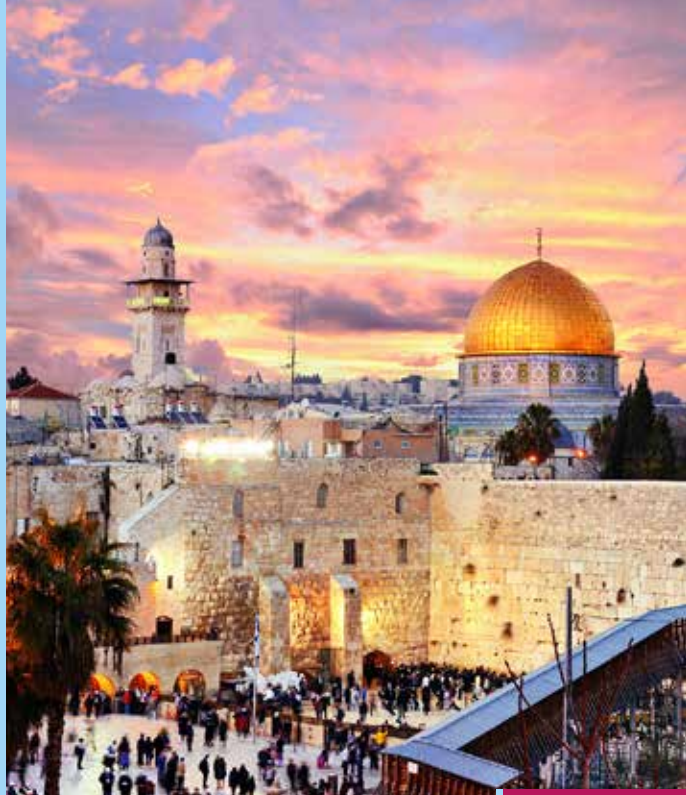
City view of Israel