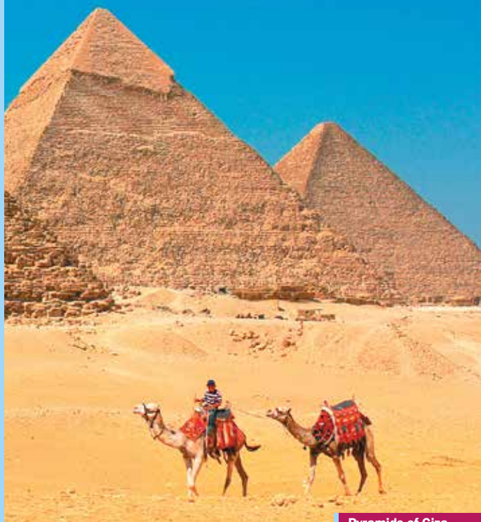
Pyramids of Giza

to protect Egypt from the Nile flood. Thereafter, enjoy sailing on the Nile River by a motor boat to reach Agilika Island, where you will visit Temple of Philae, which was erected during the Gaeco-Roman period and was dedicated to Goddess Isis (mother of God Horus). Finally you will be escorted to visit one of the marvellous sightseeing in Aswan, The unfinished Obelisk, which was made out of red granite and was dedicated to god Amun Ra. After finishing your day tour, you will proceed to your cruise for check-in. Enjoy local lunch on board the cruise. Enjoy local dinner on board the cruise.